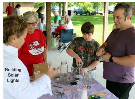
Building Solar Lights